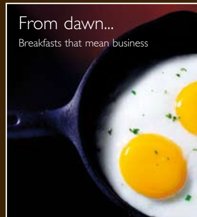
From dawn... Breakfasts that mean business